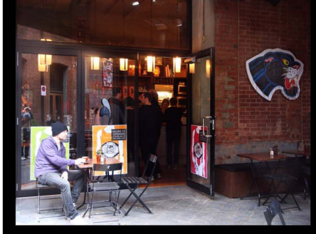
Above: C1 Espresso's new cafe on Poplar Street, featuring indoor and outdoor seating.