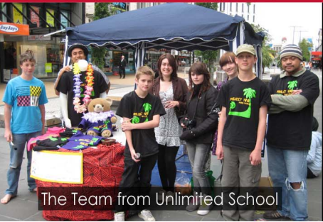
The Team from Unlimited School

Flower Show and the Buskers Festival. Best in category benches will win fantastic prizes courtesy of the sponsors Resene Paints. The theme of the competition is 'The Garden City' and artists are encouraged to interpret this freely.