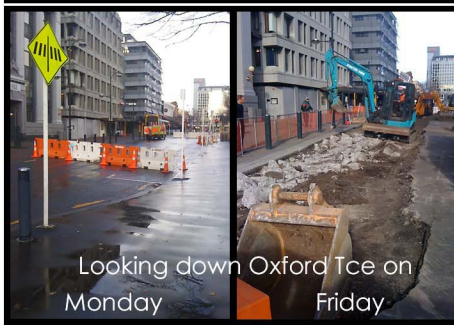
Looking down Oxford Tce on Monday Friday