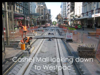
Cashel Mall looking down to Westpac

Please remember that for those of you who would like to be kept up-to-date with progress, there is a site meeting every week on Wednesday 3.30pm at In Italia in The Guthrey Centre.