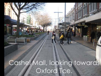
Cashel Mall, looking towards Oxford Tce.