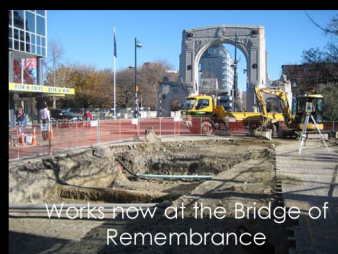
works now at the Bridge of Remembrance