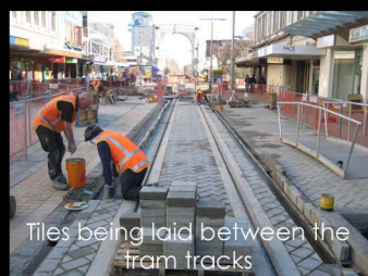
Tiles being laid between the tram tracks