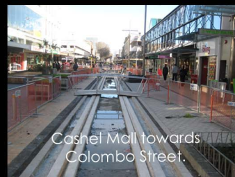
Cashel Mall towards Colombo Street.