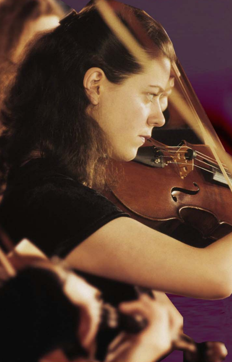
Artist impression of the proposed